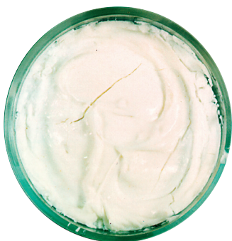
In an oven at 232 °C (448 °F) for 40 hr, Krytox™ lubricant had 0% weight loss.

Krytox™ greases and oils are non-toxic, easy to handle, and do not release volatile organic compounds to the atmosphere. Additionally, Chemours has a regeneration program that reclaims used oil and restores it to its original properties. This lowers the overall cost of lubrication, and eliminates safety and environmental disposal problems.